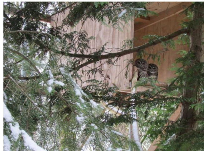
Shakkai and Einstein aren't sure what to make of all this snow!

Tis the season to puff up and stay still, and the Spotted Owls have been doing just that to stay warm and conserve their energy. The arrival of prolonged snow and -10 temperatures this December was a bit of a surprise for everyone here at the breeding facility, including the owls! Each owl has a favourite sheltered spot to hunker down when the temperature drops and the snow starts to fly. By fluffing up their feathers to trap body heat they are able to keep toasty warm during a cold stretch. This gives them an extra cute appearance, especially in the morning when they are getting sleepy and ready to relax for the day. We pay extra attention to each owl during daily observations to ensure everyone is looking healthy and well fed. At this time of year, it pays off for bonded pairs to have a cuddle buddy to sit close to and enjoy the snowfall!